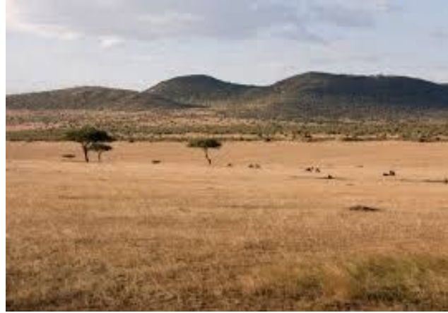
MADE UP OF GRASS AND A FEW TREES.